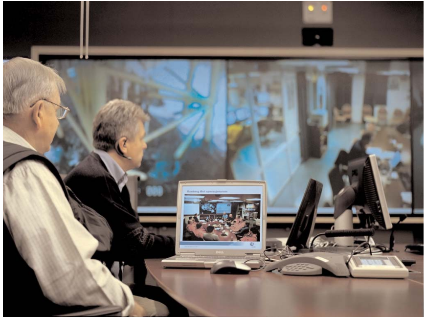
Video helps Hydro engineers in Bergen control offshore platform operations